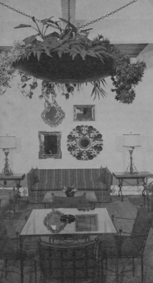
An authentic Spanish Colonial motif is carried out at the two-year old Tucson National club. It prevails not only in the clubhouse but in outlying casitas and the pro shop. Shown here is the ladies' lounge with a colorful overhead planter.