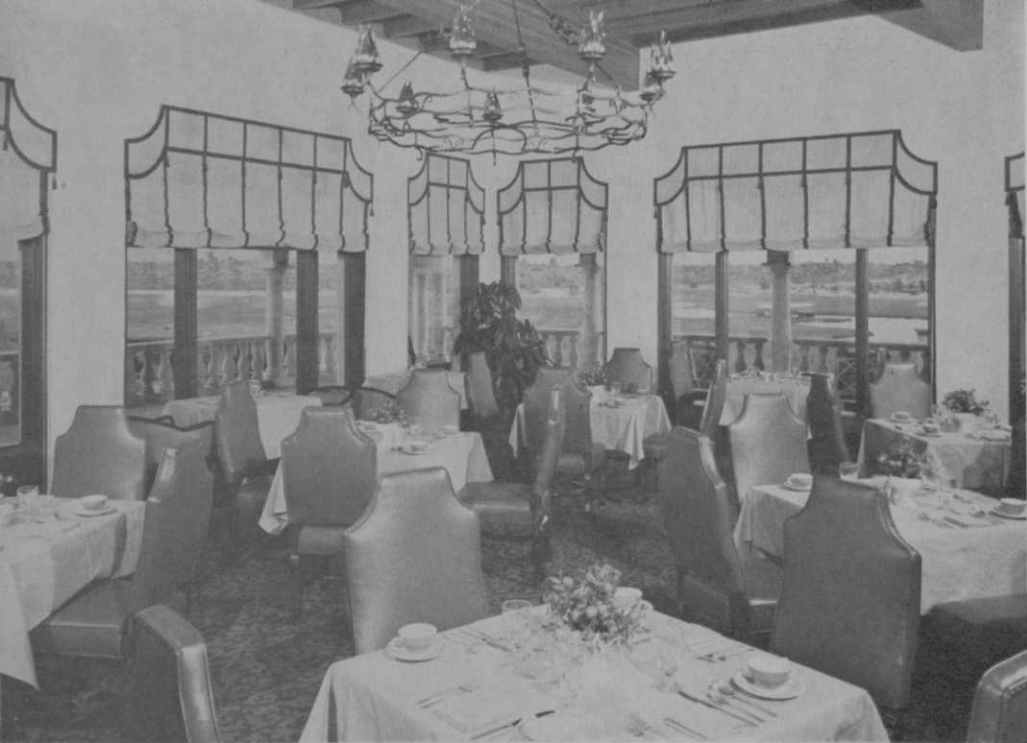
Drop shades are substituted for curtains in dining room so view of course isn't obscured.

materials such as leather instead of plastic. In addition, there were many specially made items such as the chandeliers in the dining room and lounges. All paintings came from Mexico.