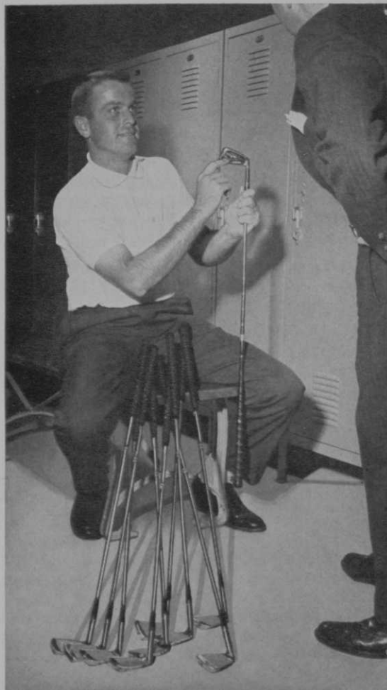
Bobby Nichols —PGA Champion and World Golf Tournament Winner