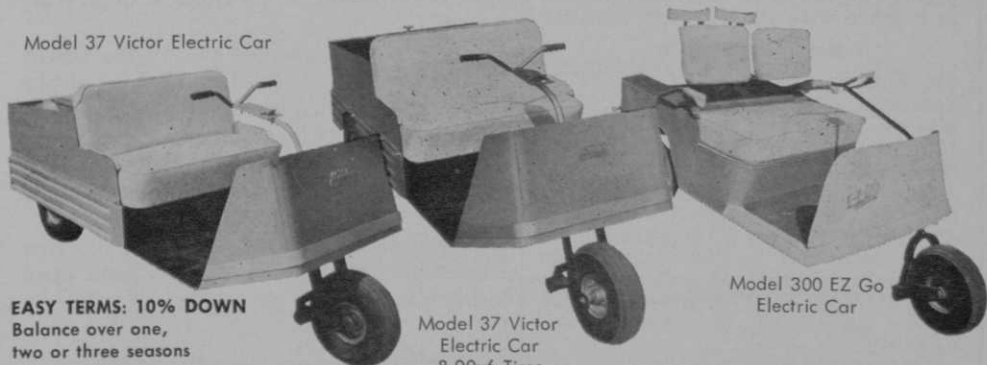
Model 37 Victor Electric Car

EASY TERMS: 10% DOWN Balance over one, two or three seasons