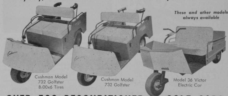
Cushman Model 732 Golfster 8:00x6 Tires

Adequate Cars at a Sensible Investment to Accommodate the Busy-Day, Weekend or Seasonal Increase in Play at Your Club.