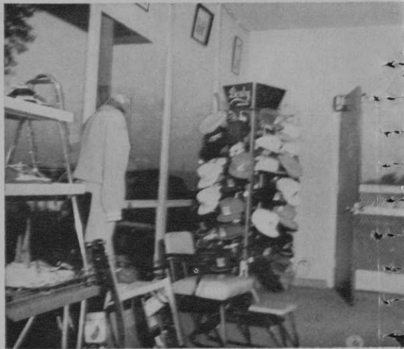
Popular Display Creations rack (l) is centerpiece around which Card designed the entire Raleigh shop. (Right) One side of shop is glassed in, serves as backdrop for cap and hat and shoe display.

as space, in which to display equipment and apparel, was made available to him. But by early fall of that year, when the shop was completed, he had built his inventory up to a $25,000 value and since then it hasn't been allowed to drop much below that figure.