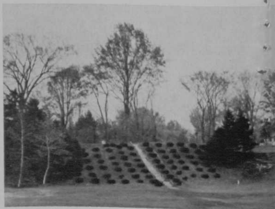
Small taxus plants that line the bank of a tee minimize erosion and give an unusual scenic effect.