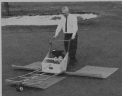
The POWER DRAG mats 9\frac{1}{2}' swath. Easy to transport — folds for storage.

ONE MAN MATS ONE GREEN in ONE THIRD the TIME