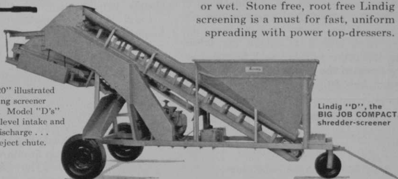
Lindig "D", the BIG JOB COMPACT, shredder-screener

Model "D-20" illustrated with vibrating screener attachment. Model "D's" feature low level intake and high level discharge . . . automatic reject chute.