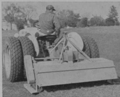
The MASTER VERTI-GROOVE designed with Renovating Reel and Slicing Blades; used in combination for thorough renovation, or separately to slice or spike.

ONE MACHINE to RENOVATE or SLICE or VERTI-CUT FAIRWAY TURF