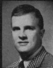
FORD WHITE NEW YORK