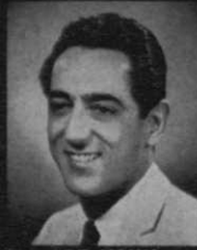
ART YANN PITTSBURGH