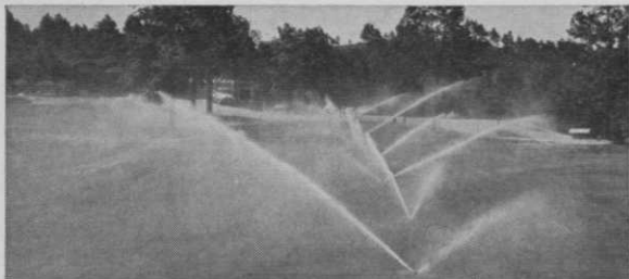
(Above) Completely automatic Rain Bird system at new Belvedere Country Club, Hot Springs, Arkansas.

PROPER SPRINKLING — Rain Bird sprinklers are scientifically engineered to provide the precise amount of sprinkling needed. No "missed" spots . . . no run-off. And no trouble!