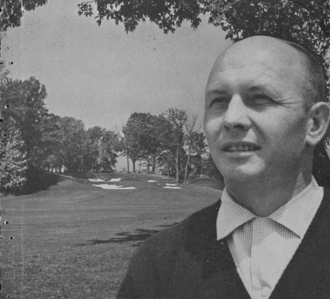
Par 4, 410-yd 1st hole of the 46th PGA Championship, July 16-19