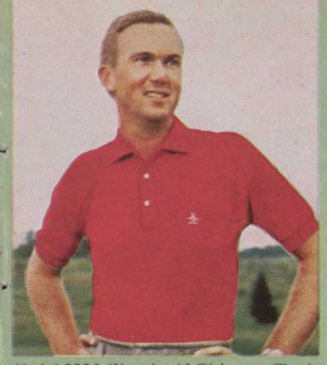
Model 2834. Worn by Al Gieberger. Classic simplicity in a well tailored shirt of light weight 2-ply lisle cotton honeycomb mesh, 3-button placket, fashion collar and cuffs, embroidered Penguin. Retail $5.00