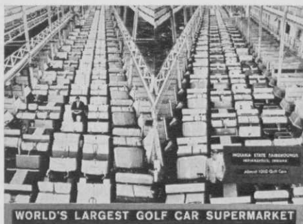
WORLD'S LARGEST GOLF CAR SUPERMARKET