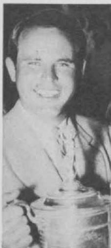
Guldahl with '37 Open Cup

Now head pro at Deauville CC, Tarzana, Calif., Guldahl, in the years of his glory, inspired the writers to turn out nearly as much copy about him as they have about Arnold Palmer in recent years. Between 1936 and 1939 he won 11 bigtime tournaments and was the runnerup in eight others. During this span, the Dallas, Tex. native won three consecutive Western Opens, the 1937 and 1938 USGA Opens and the 1939 Masters. He was runnerup in the latter event in both 1937 and 1938. Guldahl still remains the only player to have captured the Western Open three times. His best finish in the PGA Championship came in 1940 when he was a semi-finalist. He was a member of the Ryder Cup teams of 1937, 1939 and 1941.