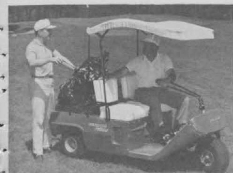
Champion Electric Golfster

Clapper and other dealers tell of new course operators being told, when they are about ready to open their courses and are nearly out of money, to borrow fairway and greenmowers and to ask for six months to a year before paying for other needed equipment and supplies, even fertilizers, fungicides and insecticides. This is not realistic advice, Clapper observes. Sometimes it is impossible to borrow equipment and credit is not always there for the asking.