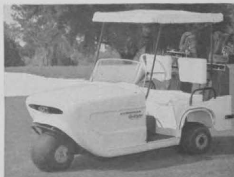
DeLuxe Gasoline Golfster