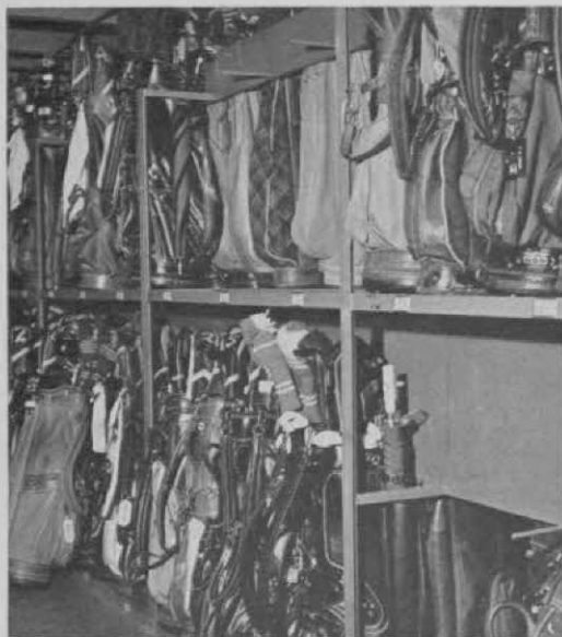
Sample section shows the bag compartment dividers For Further Information Write or Phone