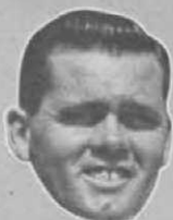
Big Boy George