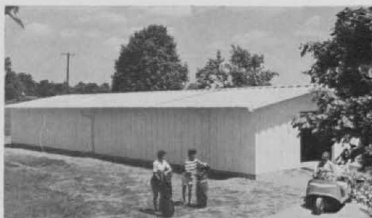
Garage accommodates 36 cars and can be expanded, if necessary. It cost less than $5,000 to erect this structure.

An additional $20,000 will be contributed to the prize purse of the Utah Open, which will be completed the same weekend as the World Series is played. The dates of last year's World Series conflicted with those of the Denver Open and a great stir was created. So, the contribution to the Utah Open can be construed as something of a peace offering. The Series now has official PGA status. Ten per cent of the Akron prize will be paid to the professional association by sponsors of the World Series.