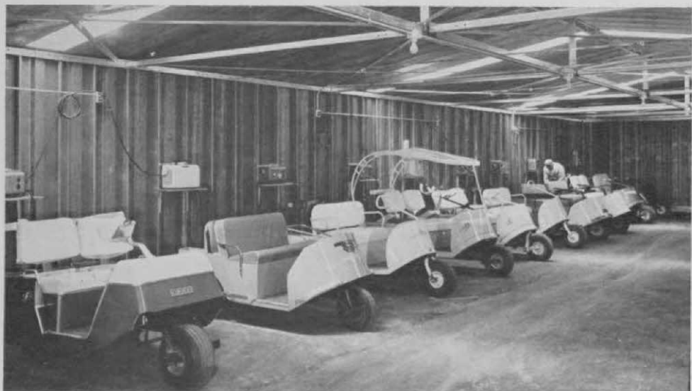
Six skylights help illuminate interior of car storage building at Middletown club. Building has a concrete floor and eight-foot wide overhead door.

Pre-engineered additions permit quick, inexpensive expansion in keeping with the building's original lines. Six reinforced plastic sky-lights provide illumination in the storage building. Supports are positioned in walls, allowing complete freedom of movement on the asphalt floor. An 8-ft wide overhead door permits easy maneuvering of cars in and out of the building.