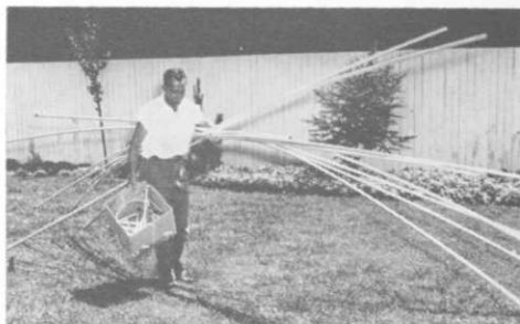
Moist O'Matic material can be carried by one man.

Moist O'Matic sprinkling systems, recently acquired by Toro Manufacturing Corp., Minneapolis, are said to be the only automatic sys-