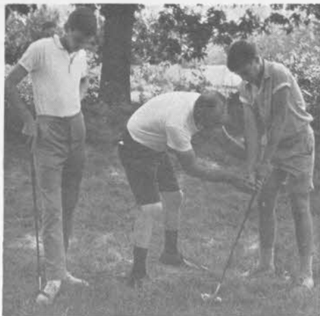
Kids will be taught all phases of golf at Windham.

There are other merits that these successful professionals share. Any man who is widely acquainted in the professional golf business is bound to be tremendously impressed, as I have been, when he specifically notes the successful professionals' personalities and performances. The successful professional in every case is an exceptionally good businessman who would be superior in almost any business.