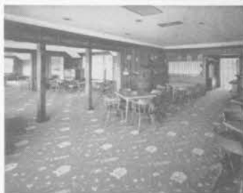
TAVISTOCK COUNTRY CLUB HADDONFIELD, N. J.

This new Beautiful Holmes "Golf Club Herald" is must reading. 12 pages of documented proof how BEAUTIFUL HOLMES GOLF CLUB CARPET has made par for the course at top flight country clubs all across the country — shows how these beautiful wiltons are tailored specifically to meet the varied and exacting demands of pro rooms . . . lounges . . . locker rooms — anywhere and everywhere that beauty and rugged durability must be combined. Case histories . . . illustrate the way BEAUTIFUL HOLMES GOLF CLUB CARPET solves a club's unique need for a flooring that must provide an atmosphere of relaxed graciousness, yet stand up to the assaults of tracked-in-turf, cleats, and lots and lots of traffic. Long lasting, easy to maintain, BEAUTIFUL HOLMES GOLF CLUB CARPET is a long-range money-saver. Send for your copy of "The Herald" — it could be the first step in reduced maintenance costs for your club!