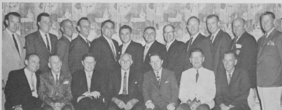
Sales and supervisory staff of DiFini Originals at New York meeting.