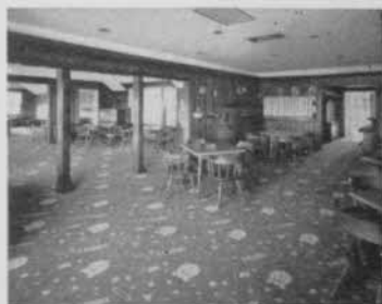
TAVISTOCK COUNTRY CLUB HADDONFIELD, N. J.

This new Beautiful Holmes "Golf Club Herald" is must reading. 12 pages of documented proof how BEAUTIFUL HOLMES GOLF CLUB CARPET has made par for the course at top flight country clubs all across the country — shows how these beautiful wiltons are tailored specifically to meet the varied and exacting demands of pro rooms . . . lounges . . . locker rooms — anywhere and everywhere that beauty and rugged durability must be combined. Case histories . . . illustrate the way BEAUTIFUL HOLMES GOLF CLUB CARPET solves a club's unique need for a flooring that must provide an atmosphere of relaxed graciousness, yet stand up to the assaults of tracked-in-turf, cleats, and lots and lots of traffic. Long lasting, easy to maintain, BEAUTIFUL HOLMES GOLF CLUB CARPET is a long-range money-saver. Send for your copy of "The Herald" — it could be the first step in reduced maintenance costs for your club!