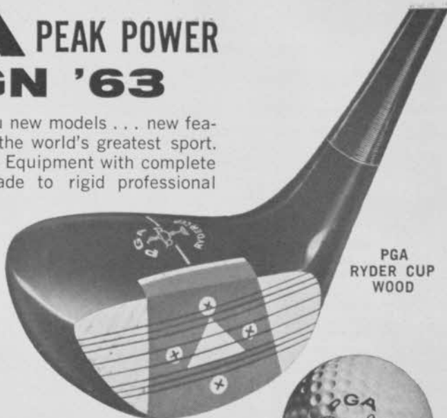
PGA RYDER CUP WOOD

PGA Equipment has been developed in cooperation with the PGA Emblem Specifications Committee. Available in every instance from the Golf Professional exclusively. PGA Equipment cannot be confused with "bargain" brands. Display the full line of PGA Equipment. It will protect the reputation for integrity that your profession owns and enjoys.