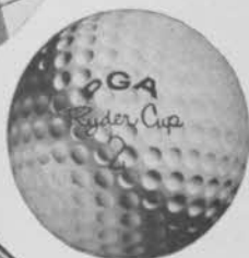
PGA RYDER CUP GOLF BALL