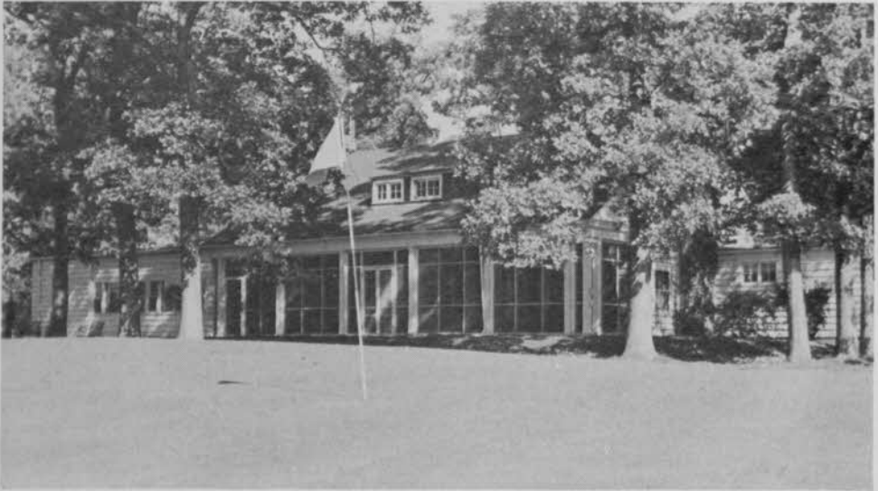
Curtis Creek clubhouse as seen from beyond the ninth green.

Golfers Pay Part of Their Way at This Indiana Course by Pitching in to Help With Maintenance and Building Chores