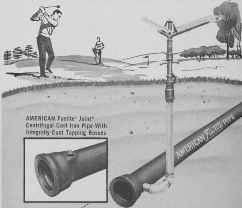
AMERICAN Fastite® Joint* Centrifugal Cast Iron Pipe With Integrally Cast Tapping Bosses