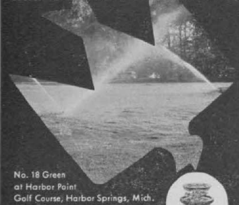
No. 18 Green at Harbor Point Golf Course, Harbor Springs, Mich.

greens stay green... when watered with RAIN BIRD'S