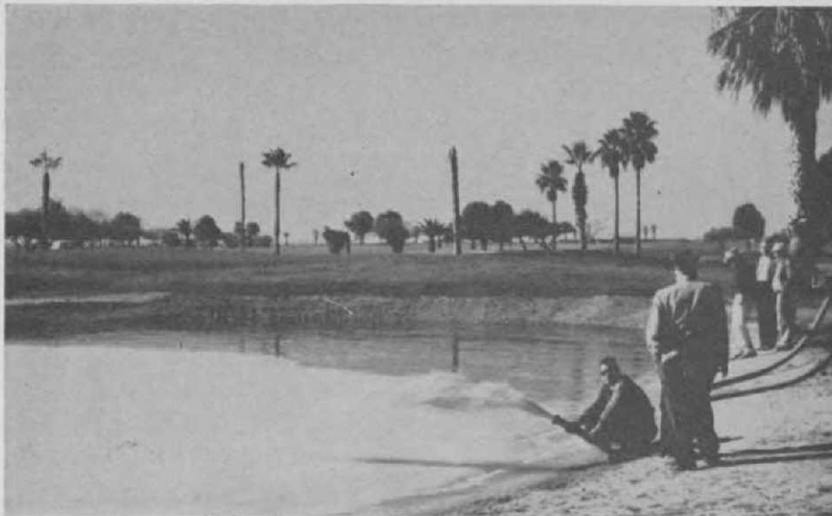
Milky SS-13 Squirts Into Golf Course Lake at Litchfield Park, Arizona. Hose Goes To Tank Truck