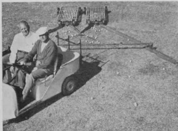
Double unit covers 15 foot swath; the two baskets have a combined capacity of 1400 golf balls, can be emptied in one minute. PRICE: $389.00 F.O.B. Tucson.

A few of the well-known golf professionals now using R.A.R. Golf Ball Retrievers: