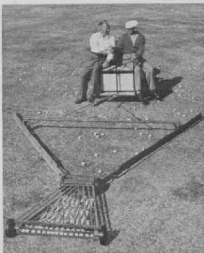
Single unit covers 11 foot swath, basket holds 700 balls, can be emptied in 30 seconds. PRICE: $268.00 F.O.B. Tucson

Both the single and double units shown here can be pulled by an ordinary golf car. Outriggers have 'side-kickers' to sweep balls out of low spots and tall grass. Basket opening has rubber lined paddle wheel to ease balls into basket.