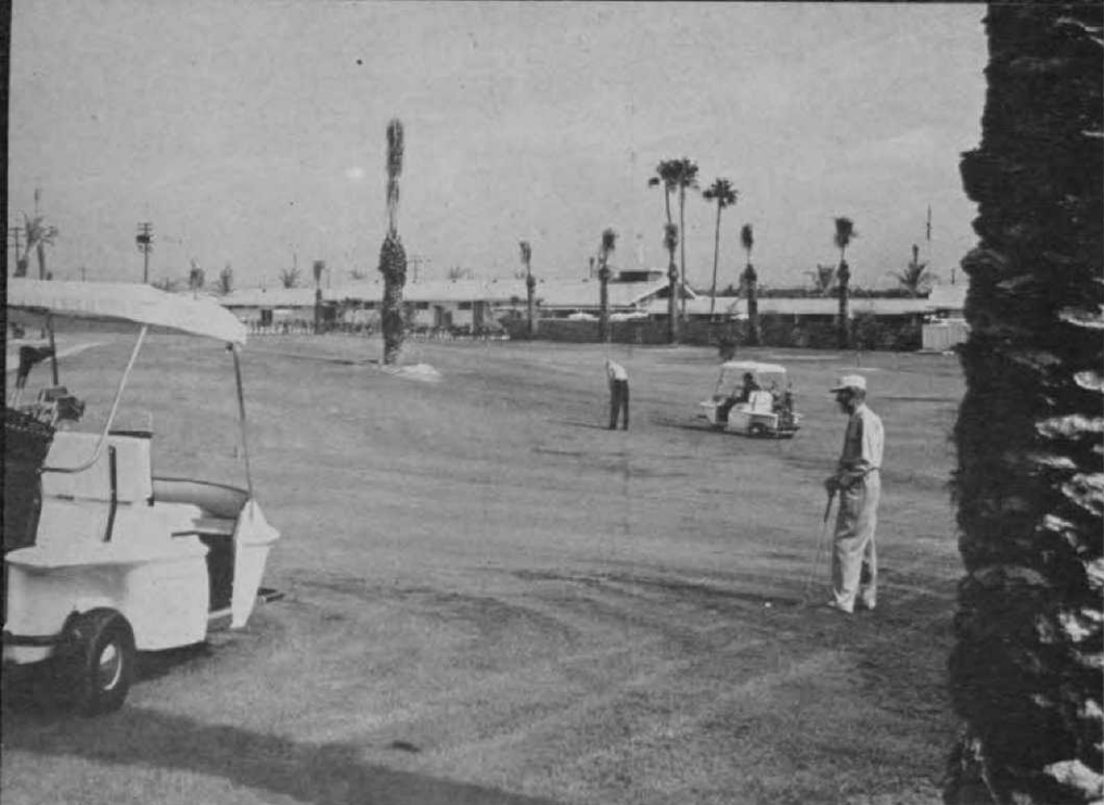
Hundreds of elder citizens play golf five days a week at the course in Sun City, Ariz. They are literally guaranteed starting times.