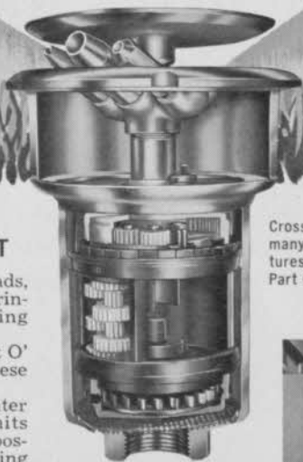
Cross section shows many exclusive features of Model 652 Part Circle Head.

For America's best turf sprinkler buy...Specify...Moist O' Matic.