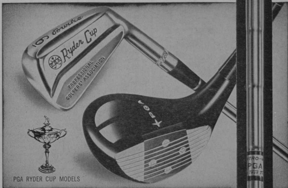
PGA RYDER CUP MODELS

The only Golf Equipment Recommended by the Professional Golfers' Association