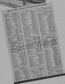
List of 180 golf clubs

This completely new twelve page brochure is must reading for every golf club manager and house committee chairman. Tells you how fabulous Beautiful Holmes Golf Club Carpet can save you money in replacement, upkeep, and daily care. Brings you facts and information about the only carpet specifically woven to withstand country club punishment. Learn how this unique Wilton can bring your club new beauty and at the same time solve your floor covering problem for years to come. Read case histories of how Golf Club Carpet is performing in pro shops, locker rooms, lounges—wherever beauty, economy and extreme wear are considerations. Check for yourself the list of 180 famous clubs, coast-to-coast, that have successfully installed Beautiful Holmes Golf Club Carpet. Send for your copy, today, and benefit your club.