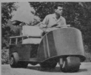
TERRA-TIRE-equipped car belongs to fleet operated at the Olympic Country Club, San Francisco.