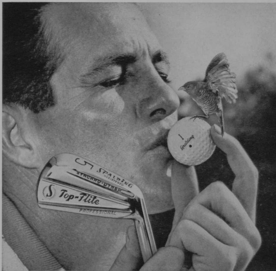
Jay Hebert, Spalding Advisory Staff Member, 1980 P. G. A. Winner