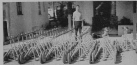
Con-Voy fleet at San Mateo muny course.

Product Engineering Co., 4707 S. E. 17th st., Portland, Ore., manufacturer of Con-Voy carts, has a pro-fleet rental plan that answers the shop storage problem and reduces the wide