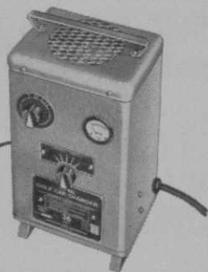
GOLF CAR BATTERY CHARGER

Keep golf cars running more profitably with the new improved AutoMAC. It's the two-rate charger that prolongs battery life because it is built to conform to the battery manufacturers' own requirements for proper charging.