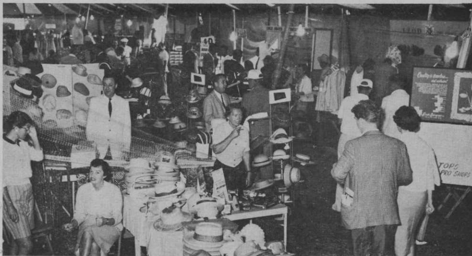
The above scene will be typical of the gathering at the PGA National course in Dunedin, Feb. 13-18, when the annual merchandising show is held in conjunction with the Seniors Championship. Two tents will house the exhibits, with the smaller one being used for golf cars and the larger, other types of golf merchandise.