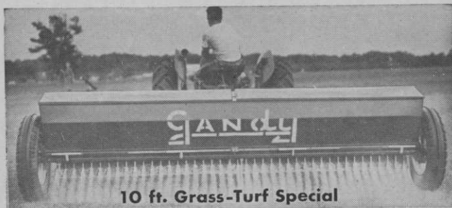
10 ft. Grass-Turf Special