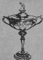
PGA RYDER CUP MODELS