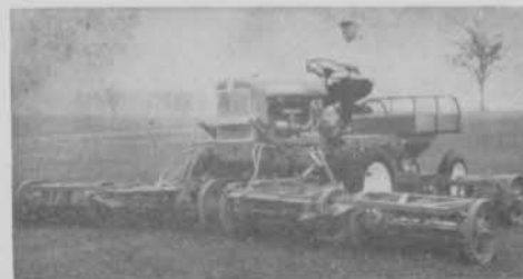
Worthington Model F tractor & fairway unit

ly displayed include the greens mower with the "321" engine; Mow-Mobile "48"; 3- and 5-