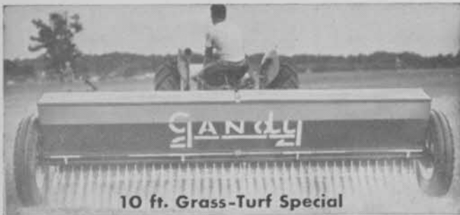
10 ft. Grass-Turf Special