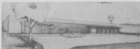
What new Dunlop S. C. plant will look like.