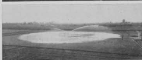
Architect's drawing of new plant, and test stand are shown in these photos.

can be timed and checked under various water pressures and with different nozzle sizes. More than $75,000 was spent on the lab and test areas. Cleason reports that Buckner recently has opened branches in Mexico City and Sydney, Australia.