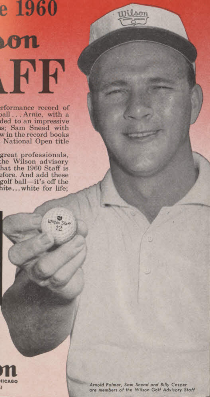
Arnold Palmer, Sam Snead and Billy Casper are members of the Wilson Golf Advisory Staff

WILSON SPORTING GOODS CO., CHICAGO (A subsidiary of Wilson & Co., Inc.)