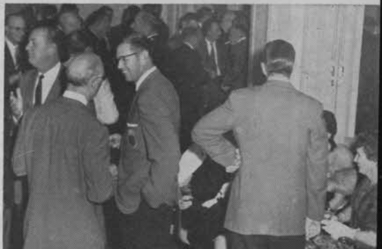
. . . So maybe we should stay in Clearwater.