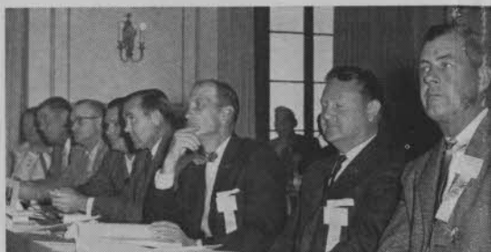
Here are PGA reps from the Southwest...