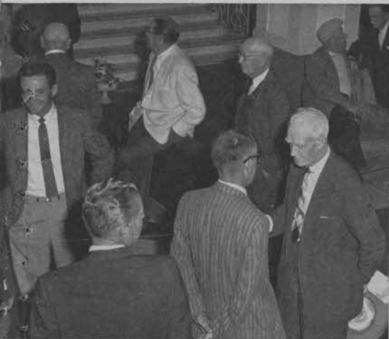
"There I was two down and stymied" . . .