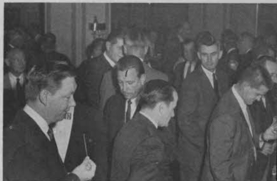
The glory of the house is conviviality . . .