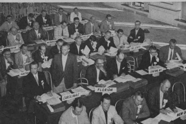
Chairs began to feel like bucket seats after first day's session but caucusing went on for a week.