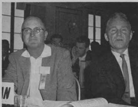
Metropolitan Section was represented...