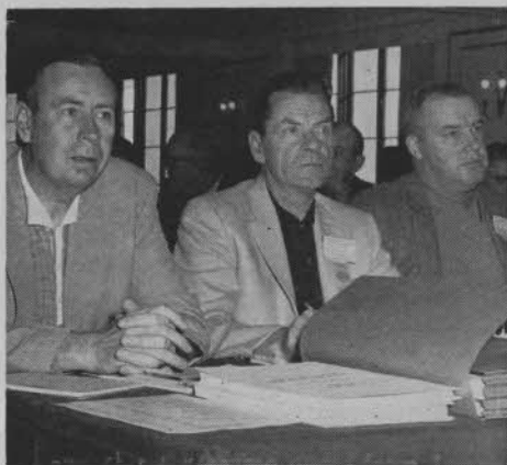
...and this threesome came from Jersey.