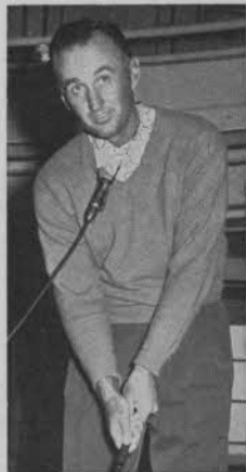
Art Wall, Jr.