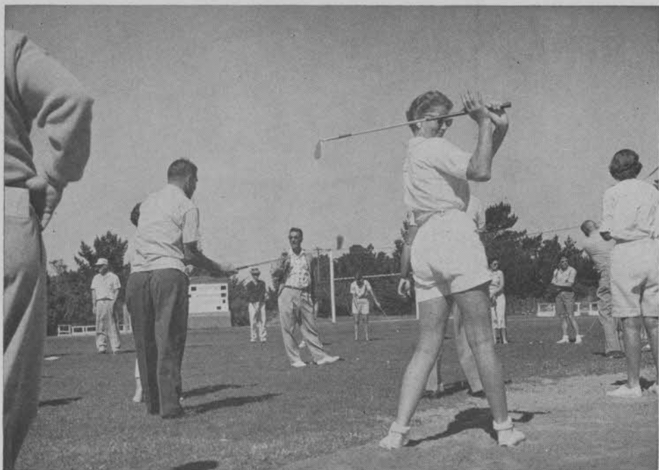
Women school teachers in Monterey area gather on football field to get instruction on the swing.