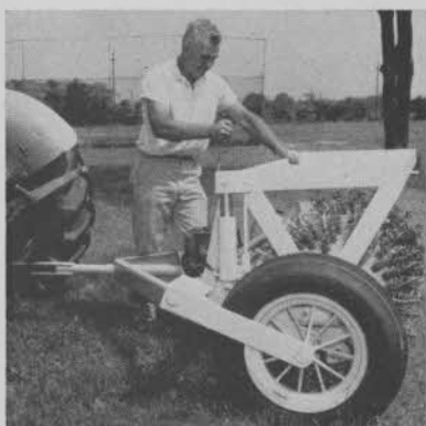
Hydraulic control provides fast lowering and raising of Spoons.

Whether your fairways require routine conditioning or a drastic "scorched earth" program, the turfgrass tool which can do the most for you this fall is the Grasslan Aerifier. Rugged, dependable and effective, the Grasslan is built for large acreage aerifying. Its 6 ft. width means fast coverage. Its rigid construction means full coverage. Not only does this rigid construction ensure penetration of Spoons into heavily compacted areas, but the tray holds extra weight as needed.