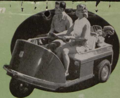
THE LAHER DELUXE GOLFER

The Laher DeLuxe Golfer is the dependable and economical favorite all over America where turf damage is not a problem. Like all Laher electrics, the Golfer features LUB-O-MATIC Drive for clean, silent, trouble-free operation—no noise or fumes to distract players. Laher cars are rugged—built to last 20 years. Exclusive Laher AIR-VAC spring suspension provides stability and comfort.