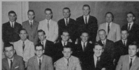
1959 Penn State turf graduates.

Eighteen persons attending the Turf Management winter course at Penn State University will be graduated on Mar. 24. The graduates will have completed two