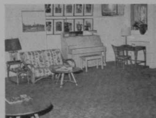
PGA CLUB DUNEDIN, FLA.