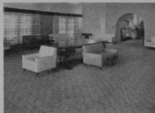
GRIFFITH PARK GOLF CLUB LOS ANGELES, CAL.

... see what 50 famous clubs have already found out for themselves. Every page a case history of how these clubs have benefitted by putting proven "Quality 282" in pro shops, locker rooms, lounges ... throughout! Send for your copy, and benefit yourself !