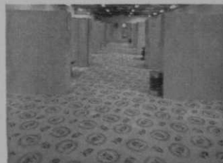
NASSAU COUNTRY CLUB GLEN COVE, N. Y.