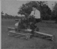
The Worthington Triplex delivers three-gang capacity at power-mower price!