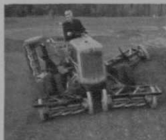
Worthington Model "G" with "Wing-Lift" hydraulic control offers either three, four or five units.

It's easy to arrange a "NO OBLIGATION" demonstration and job test Worthington equipment on your problem mowing. Just use the coupon below to arrange a "NO OBLIGATION" on-the-job test or to request complete literature.