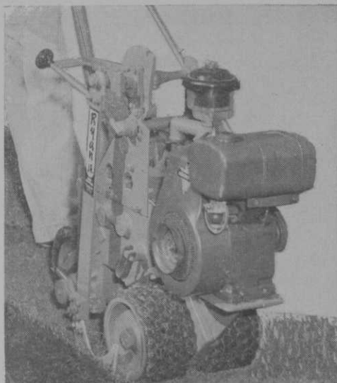
CUT NURSERY SOD