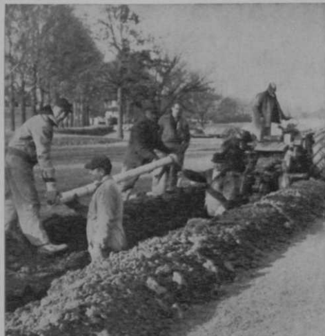
Whitemarsh maintenance crew was able to lay up to 1,000 ft. of pipe in eight hours. Operation went on even during the winter.

tegrated underground system geared to the needs of a busy course.