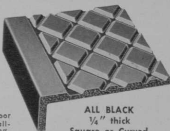
ALL BLACK 1/4" thick Square or Curved Nose

For all club-house areas where a SAFE, resilient, wear-resistant floor covering is needed to meet tough traffic conditions --- locker rooms, hallways, pro-shop, club grill, etc. Marbleized colors or black --- 1/8", 3/16", in color; Also 1/4", 5/16", and 3/8" thickness in black. Cut to dimensional specifications or in rolls 36" wide.