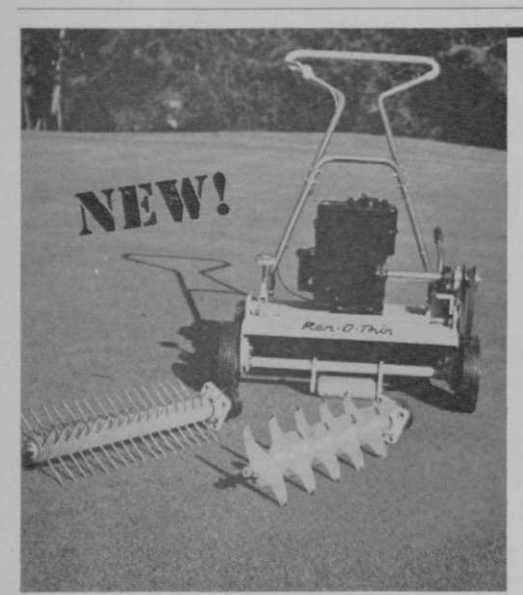
Two types of reels, for renovating and slicing. Removable front roller for putting greens. Grass catcher optional.

Lot of course reconstruction and modernization being planned as fall and winter work at older clubs . . . Superintendents have worked some miracles the past few years in revising courses without interfering with play and at amazingly