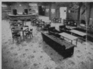
CALIFORNIA COUNTRY CLUB SAN FRANCISCO, CALIF.

I want to see the new GOLF CLUB HERALD, listing the 50 famous clubs that have successfully installed Beautiful Holmes Quality 282.