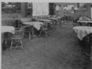
PENINSULA COUNTRY CLUB SAN MATEO, CALIF.