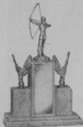
Marnyx Base Burlwood Brown J2900-5 — 10 1/2" $6.70