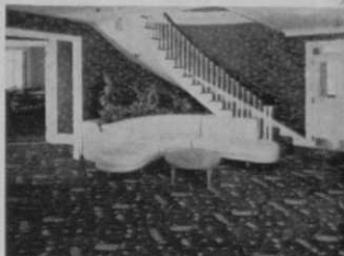
OAKLAND HILLS COUNTRY CLUB DETROIT, MICH.