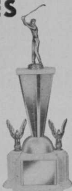
Sunray & Ivory JB18A-5-18" $11.70 JB18B-5-17" 11.10 JB18C-5-16" 10.60

WRITE FOR FREE 1959 CATALOG THE TROPHY AND MEDAL SHOP