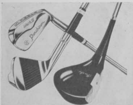
New Clubs in Burke's 1959 Line.