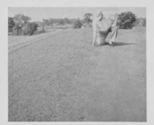
Some of aprons around Penncross greens at new Royal Montreal course are in Merion blue, Seeding rate was 2 lbs. per 1,000 sq. ft.