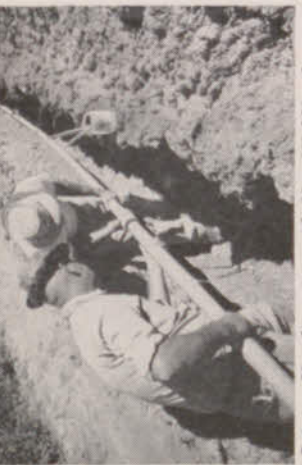
foining Uscolite pipe with UscoWeld* solventweld fittings. Each joint takes about 90 seconds

Take a look at Baltimore's lush new 6600-yard municipal by a special watering system which flows through Uscolite® plastic pipe. Over 19,000 feet of Uscolite pipe (in sizes from 4" to 6" i.d.) spread into an underground network running golf course, Pine Ridge. Its beautiful greenery is nourished greens, clubhouse and certain fairway locations.