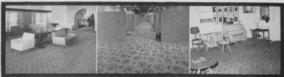
GRIFFITH PARK GOLF CLUB LOS ANGELES, CAL.

New "Golf Club" Herald shows what it is doing for clubs everywhere!