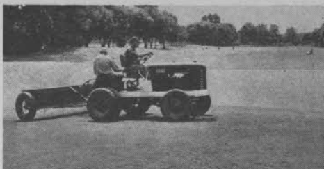
Vermiculite spread and matted into green aprons at Bryn Mawr CC, Lincolnwood, Ill.

A fine grade of vermiculite, (No. 4, sold under trade name, Terra-Lawn), is used for topdressing. The fine particles flow readily into holes left by the aerator and by filling the holes with