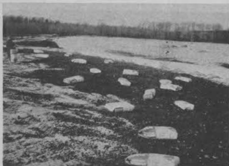
Vermiculite bags are opened and spread over new green areas.

Between vermiculite layers is entrapped moisture, which turns to steam when the ore is heat-