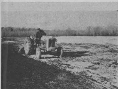
Vermiculite is then tilled into the soil.

Supts. are employing vermiculite in two ways: