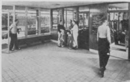
Golf Club Tile is used in Dunwoodie pro shop.

High maintenance and replacement costs are said to be avoided with specially designed material such as Golf Club Tile that is installed on