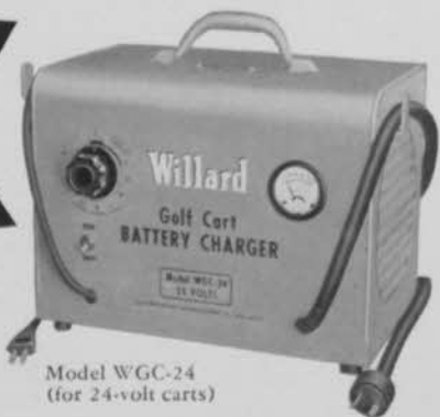
Model WGC-24 (for 24-volt carts)

Willard Storage Battery Division Cleveland 1, Ohio