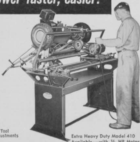
Extra Heavy Duty Model 410 Available—with 1/2 HP Motor.

FEATURING: Rugged construction • Machine Tool Precision • Horizontal-Vertical screw-type adjustments • Overhead Bar for solid 3-point support