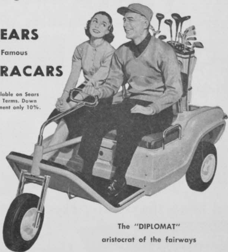
The "DIPLOMAT" aristocrat of the fairways

Available on Sears Easy Terms. Down Payment only 10%.