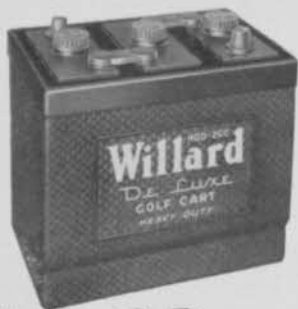
Model HDD-2GC (6-volts)

Designed and built specifically for golf cart use, this heavy duty Willard Battery has extra capacity for hot weather use . . . for 18, 24, 30 or 36-volt power systems . . . provides ample power for the toughest 18-hole layout.