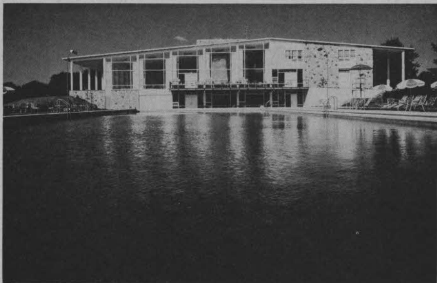
Philadelphia CC's ultra modern clubhouse and Olympic pool, opened last summer, may well set a trend in country club architecture. The $1.5 million project commands a view of the Schuylkill Valley and has separate recreation areas for each member of the family. Philadelphia CC is the third oldest organized club in U. S. and was second to receive a PGA charter.