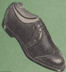
5527 Black imported grain and cherry cordovan blucher with shield tip. Rex last. $36.95