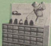
Sell-O-Matic Display Units