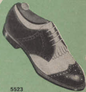
5523 Black calf and white buck saddle blucher... with shield tip and fringe tongue. Rex last. $32.95

Champion-Quality FOOT-JOY Golf Shoes, worn by 90% of Home and Touring Pros, are the most famous, the most wanted golf shoes in America today. For the club member willing to spend a few extra dollars for the very best — the ultimate in quality — FOOT-JOY is the perfect golf shoe. No other golf shoe made can even approach FOOT-JOY, for comfort, wear, complete satisfaction and for sheer pride in having the very finest. No Pro Shop is a REAL Pro Shop, without FOOT-JOY Golf Shoes.