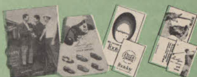
Display and Mailing Pieces, Hangtags, etc.