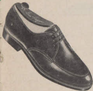
H-211 Black grain 3 eyelet blucher overlay, single sole. (H-210 Tan) $24.95