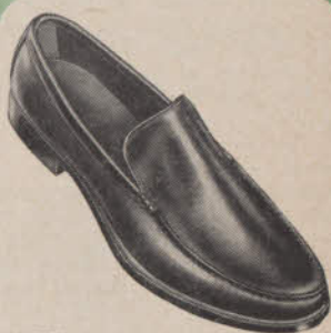
H-881 Black crushed calf hand-sewn moccasin. (H-880 Dark Brown) $22.95

The perfect choice for your club members who want superb styling and exceptional comfort in a golf shoe — yet want to spend around $25. Here is undoubtedly the most striking value ever offered at this popular price — with many features found only in higher priced golf shoes. And, as an immeasurable “plus”, they’re backed by all the impact, all the prestige, all the selling power, of the greatest name in