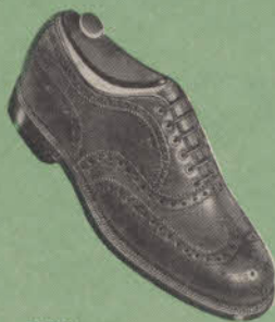
5518 Tan boarded-calf wing tip, with cushioned innersole. Aintree last. $36.95