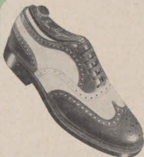
H-206 Tan grain and white buck, bal wing tip, double sole. $24.95