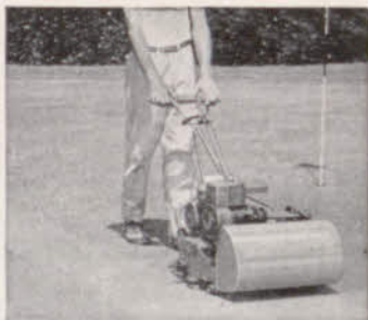
GREENS? 21-inch Toro Power Greensmower cuts closer, throws more clippings into the grass box.