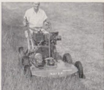
ROUGH AREAS? Spin through grass or tangled growth with the 31-inch Toro Whirlwind. Sulky optional.