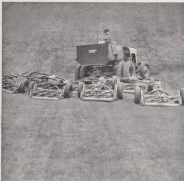
FAIRWAYS? 7-unit Universal Frame (shown with Toro General Tractor) mows a swath approximately 17 ft. wide.