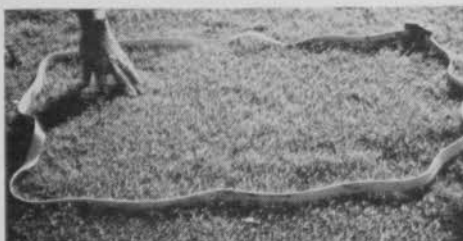
With Terra-Lite: strong, even stand of grass, no bare spots.