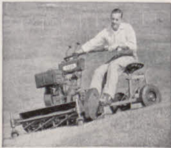
CLUBHOUSE GROUNDS? Differential on 30-inch Toro Park Special gives high maneuverability.

Reel or rotary... push-type, self-propelled or riding... small, medium or large—Toro builds the right power mower for every golf course need because Toro builds the world's most complete line.