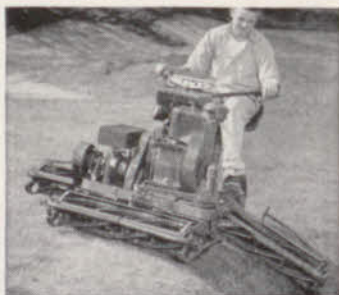
UNEVEN GROUND? Hinged "wing" reels of the 76-inch Toro Professional hug ground contours.