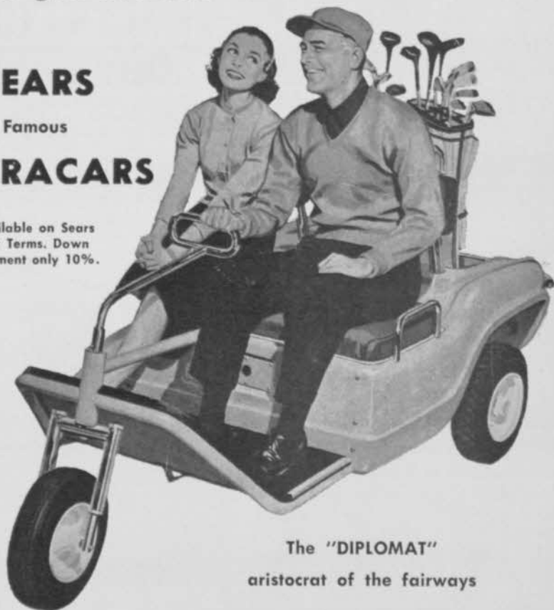
The "DIPLOMAT" aristocrat of the fairways

Available on Sears Easy Terms. Down Payment only 10%.